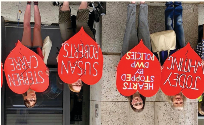
DWP KILLS DISABLED PEOPLE

14 Oct 2009 The Express publishes misleading and inaccurate benefit fraud story about incapacity benefit claimants "faking their illnesses".